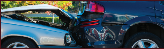
Auto & Trucking Accidents