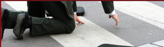
Slip and Falls