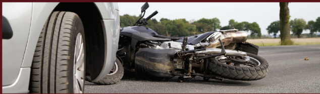
Motorcycle & Bicycle Accidents